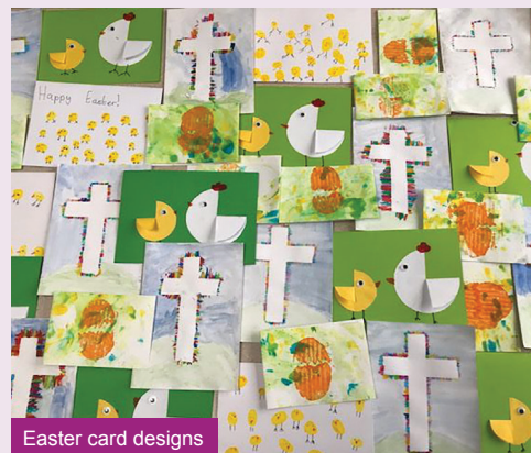
Easter card designs

These were distributed with chocolate goodies to SVP beneficiaries and one of the care homes in their area.